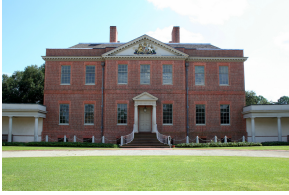
Figure 2. Tryon Palace in New Bern was too closely tied to royal government to serve as the capitol of an independent North Carolina.

Starting in 1766, New Bern served as the colony’s seat of government, and Tryon Palace was constructed to serve as the Governor’s residence. During the Revolution, however, the Palace was too much associated with royal government. Wary of invasion, the state government once again became migratory. In the years between 1715 and 1787, the legislature met at numerous locations throughout North Carolina including Queen Anne’s Creek, Edenton, Wilmington, Bath, New Bern, Kinston, Halifax, Smithfield, Hillsboro, Salem, Fayetteville, and Tarboro.