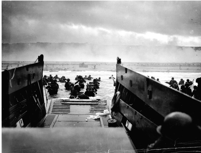
Figure 1. American soldiers land on Omaha Beach on D-Day, June 6, 1944.