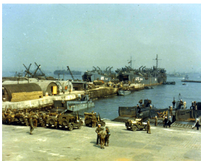
Figure 2. Allied soldiers loading equipment for the D-Day invasion, June 1944.

U.S. President Franklin D. Roosevelt, Soviet leader Joseph Stalin, and British Prime Minister Winston Churchill were responsible for leading their nations to victory and jointly planned strategies for the cooperation and eventual success of the Allied armed forces. Roosevelt and Churchill had already agreed early in the war that Germany must be stopped first if success was to be attained in the Pacific. They were repeatedly urged by Stalin to open a “second front” that would alleviate the enormous pressure that Germany’s military was exerting on Russia. Large amounts of Soviet territory had been seized by the Germans, and the Soviet population had suffered terrible casualties from the relentless drive towards Moscow. Roosevelt and Churchill promised to invade Europe, but they could not deliver on their promise until many hurdles were overcome.