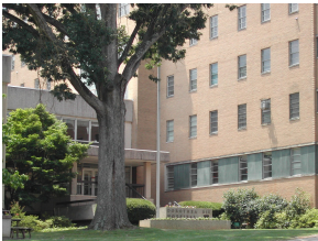
Figure 2. Today, Dix Hospital includes 120 buildings, has a staff of 1,300, and can accommodate more than 600 patients.

Interest in the treatment of mental illness had been expressed in North Carolina in 1825 and 1838 but with no results. Several governors suggested care of the mentally ill to the General Assembly as a legislative priority, but no bill was passed. Then in the autumn of 1848 the champion of the cause of treatment of the mentally ill made North Carolina the focus of her efforts. Dorothea Lynde Dix was a New Englander born in 1802. Shocked by what she saw of the treatment of mentally ill women in Boston in 1841 she became a determined campaigner for reform and was instrumental in improving care for the mentally ill in state after state.