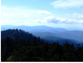
Figure 4. Clingmans Dome, on the border between North Carolina and Tennessee, is the second-highest peak in the eastern United States.

Everyone did not agree with Mitchell's claim that he had identified the highest point in North America east of the Mississippi River. In 1855 Thomas Clingman — a state senator and a former student of Mitchell's at the University of North Carolina at Chapel Hill — climbed and measured a peak he claimed was the highest, a peak he said that Mitchell had not climbed. Over the next two years, Clingman and Mitchell argued through local newspapers. Finally, Mitchell decided to make another trip to the Black Mountains. On Saturday, June 27, 1857, he set off on foot to contact some of his former guides. He never returned. A week later, after no sign of Mitchell, search parties formed. Zebulon Baird Vance — a native of Buncombe County, a political opponent of Clingman who later would become governor, and a friend of the Mitchell family — helped direct the search. After three days, searchers found footprints leading to a creek and waterfall. Mitchell's body was in the pool of water at the base of the waterfall. It was determined that he slipped and fell, was knocked unconscious, and drowned. Mitchell was buried first in Asheville. A year later he was reburied on the Black Mountain peak that is now known as Mount Mitchell.