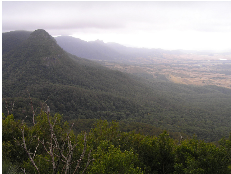
Figure 1. Mount Mitchell, in Yancey County, is the highest peak in the eastern United States.

By Suzanne Mewborn. Reprinted by permission from Tar Heel Junior Historian 46, no. 1 (Fall 2006) copyright North Carolina Museum of History (see http://ncmuseumofhistory.org ).