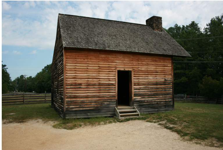
Figure 1. The Bennett house, on the road from Hillsborough to Durham Station, was the site of the largest surrender of the Civil War.