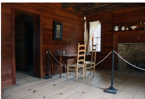
Figure 4. The desk at which Johnston and Sherman signed their terms has been preserved.

The surrender spared North Carolina the destruction experienced by her neighboring states. Equally important, the economy of the entire state and the development of Durham were boosted when troops in the area were introduced to “bright leaf” tobacco.