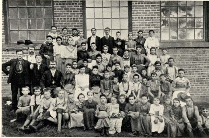
Fig. 28. Group of Southern Cotton Mill Operatives.