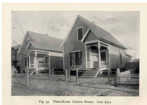
Fig. 35- Three-Room Narrow House. Cost $325