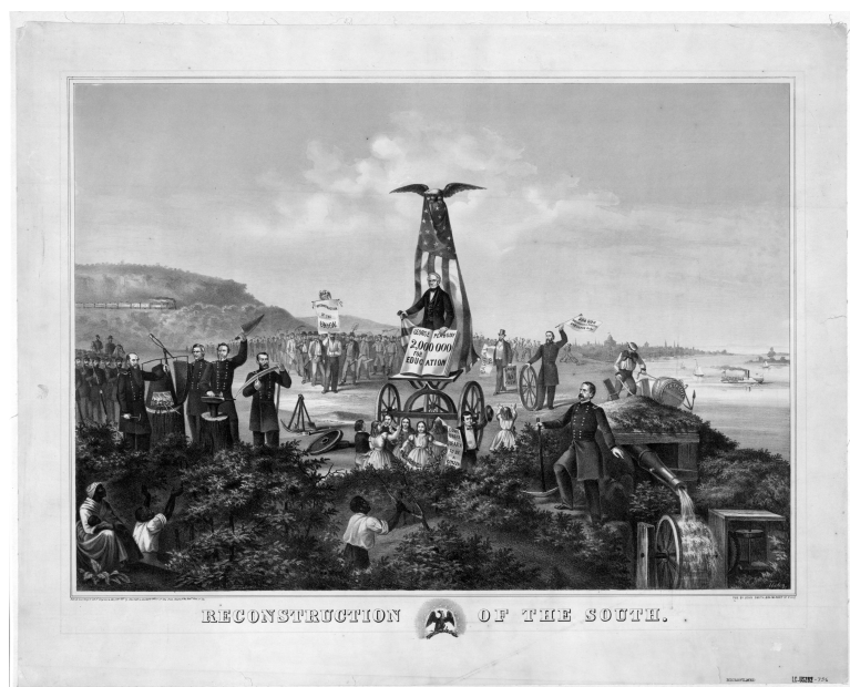
Figure 1. A poster, published in Pennsylvania in 1867, promotes the "Reconstruction of the South." It shows Reconstruction supported by farmers, mechanics, and laborers -- the good working people of the North, in other words. Meanwhile, a sign condescendingly invites African Americans to "come... learn to be citizens!" The illustrator may not have been any more eager for blacks to be equal citizens than most defeated Confederates.

From Outline of U.S. History (see http://www.america.gov/publications/books/history-outline.html ).