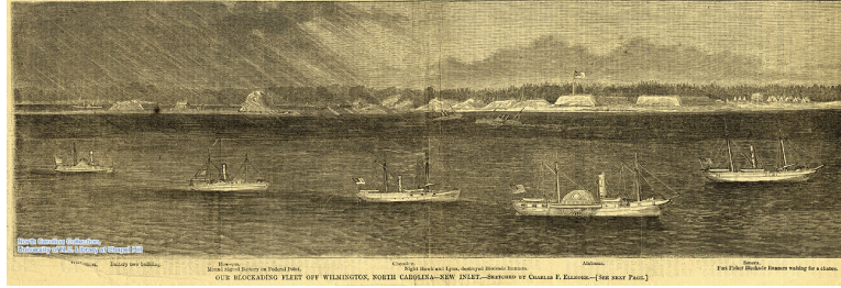
Figure 1. Union ships waiting off the mouth of the Cape Fear River, as illustrated by the northern magazine Harper's Weekly . Compare this picture to Belle Boyd's story — how do they differ in their portrayals of the blockade?