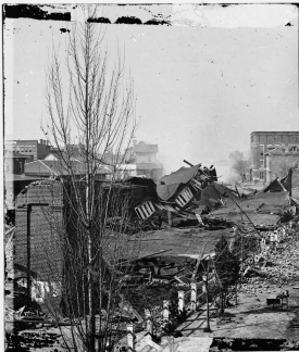
Figure 1. Sherman's army left Atlanta in ruins in November 1864 and marched to Savannah, the famous "March to the Sea."