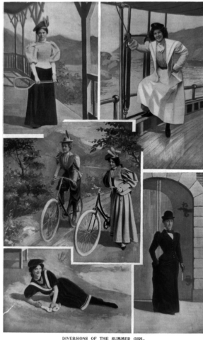
Figure 2. A magazine portrayed these “diversions of the summer girl” in 1896, which included tennis, sailing, bicycling, and going to the