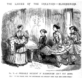
Figure 3. This sketch from the British magazine Punch in 1851 warned of “A probable incident if bloomerism isn’t put down.”