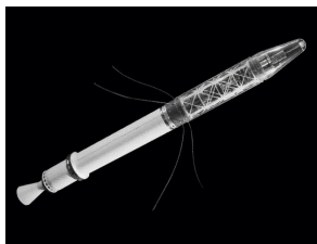
Figure 2. Explorer I, the first U.S. satellite, was launched into earth orbit in January 1958.