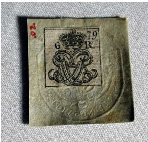
Figure 2. The Stamp Act taxed all paper products — legal documents, business records, even playing cards — and required stamps like this one to be placed on them as proof of payment.

By 1774, opinion among the colonists was mixed. Some Bostonians felt that the time had come to ease tensions and sent to London a written offer to pay for the destroyed tea. Others put out a colony-wide call for a boycott. However, many colonial merchants were reluctant to participate in a difficult-to-enforce boycott. Despite this disagreement, most colonists agreed that a meeting to discuss an appropriate collective response to British