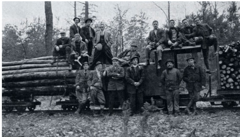
Figure 1. Students from the Biltmore Forest School inspecting a portable forest railroad in Darmstadt, Germany, c. 1912.