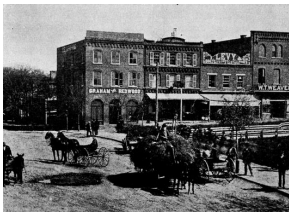
Figure 6. In this 1888 photograph, the Buck Hotel can be seen in the background at left.