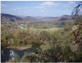
Figure 3. A view of Hot Springs, North Carolina, from the “Lover’s Leap” overlook over the French Broad River. Roads followed the paths of rivers and gorges, and travelers were treated to — or perhaps terrified by — views like this.

all the amusements of a frontier region. The work sometimes suffered from these diversions.