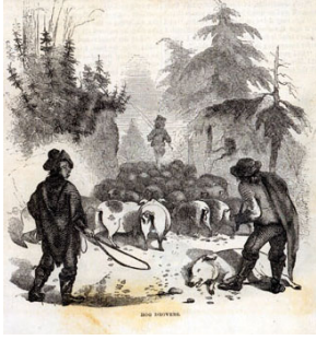
Figure 4. Hog drovers in western North Carolina.

By the early nineteenth-century, these roads were heavily traveled by settlers who were moving west to claim new land. Their covered wagons come from the east through the Hickory Nut Gap (Sherill's Inn in Fairview was established along this route around 1801) and from the south through Saluda Gap. Because its rivers flowed west and not east, Western North Carolina had little benefit from trade with population centers to the south and east. However, the mountain region's Indian corn had a market in plantation country where the focus was on producing cash crops such as cotton, indigo, cane, and rice. In 1819, the North Carolina General Assembly created a Board of Internal Improvement and hired a state engineer to build roads in Western North Carolina. The plans included a road from Asheville to Charleston, South Carolina, and a turnpike (The Buncombe Turnpike) along the French Broad River that would connect with a road running from Greenville, Tennessee to Greeneville, South Carolina.