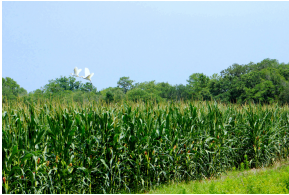
Figure 7. The demands of stock drovers made corn the region's first cash crop.

The stock drives had a greater impact on the local economy than the early tourists. The greatest benefit to Buncombe farmers was the enormous demand for corn to feed the droves of animals. In 1828, Candler sold some 2,000 bushels of corn to hog drovers. Based on a diet of 24 bushels daily for each 1,000 hogs, Candler had fed around 80,000 hogs at his stand and, those drovers would have stopped elsewhere each day. New land was cleared to grow the corn that became the region's first “cash crop.” This led to increased settlement along the roads, additional cleared land, and larger fields. For example, James Smith had some 350 cleared acres for planting at one of his farms. These larger plantations required more labor, marking an increase in slavery in the region.