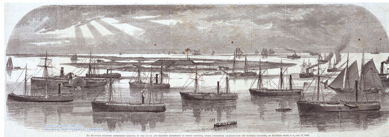
Figure 1. The Burnside Expedition arrives in Hatteras Inlet, January 1862.