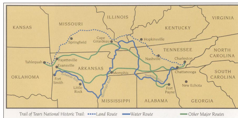
Figure 1. The Trail of Tears Historic Trail follows the land and water routes followed by American Indians during removal. The largest group of Cherokees followed the land route, leaving Tennessee in the late fall of 1838 and arriving in Indian Territory in March 1839.