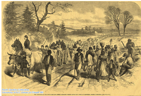
Figure 3. This illustration appeared in a weekly magazine after the Emancipation Proclamation was issued. The caption reads, "The effects of the proclamation — Freed negroes coming into our lines at Newbern, North Carolina."

Now, therefore I, Abraham Lincoln, President of the United States, by virtue of the power in me vested as Commander-in-Chief, of the Army and Navy of the United States in time of actual armed rebellion against the authority and government of the United States, and as a fit and necessary war measure for suppressing said rebellion, do, on this first day of January, in the year of our Lord one thousand eight hundred and sixty-three, and in accordance with my purpose so to do publicly proclaimed for the full period of one hundred days, from the day first above mentioned, order and designate as the States and parts of States wherein the people thereof respectively, are this day in rebellion against the United States, the following, to wit: