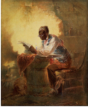
Figure 2. In this contemporary painting, a black man reads a newspaper announcing the Emancipation Proclamation.