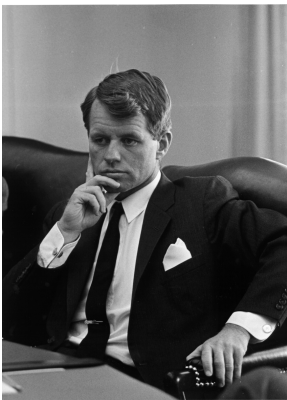
Figure 2. Attorney General Robert F. Kennedy was a vocal supporter of the civil rights movement.

The Freedom Riders’ victory set the tone for the great civil rights campaigns that followed. Not for the first time during these climactic years, a free press forced Americans to take a cold, hard look at the reality of racial oppression. The Birmingham mob beat