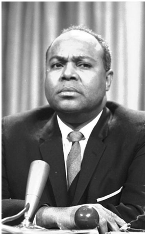
Figure 1. James Farmer was one of the founders of the Congress on Racial Equality.

Some of the young Nashville sit-in leaders joined up with the Student Nonviolent Coordinating Committee, which in 1961 helped to launch the “Freedom Rides.” Back in 1946, Thurgood Marshall’s NAACP lawyers had obtained a Supreme Court ruling 1 that barred segregation in interstate bus travel. (Under the U.S. federal system of government, it is easier for the national government to regulate commerce that crosses state lines.) In the 1960 Boynton v. Virginia decision, the Court expanded its ruling to include bus terminals and other facilities associated with interstate travel. But possessing a right and exercising it are two very different things.