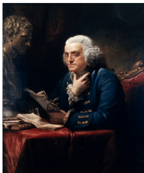
Figure 2. Benjamin Franklin was the most prominent American to call for a union of the colonies.

The Albany Congress began on June 19, and the commissioners voted unanimously to discuss the possibility of union on June 24. The union committee submitted a draft of the