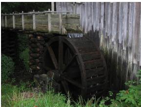
Figure 2. A grist mill in western North Carolina.

Dowd was involved in North Carolina's first Revolutionary War battle, but not directly in the fighting. In January 1776, Royal Governor Josiah Martin expected British troops to land soon on the coast. The governor wanted the people to show their support for him and King George's government so that the British would try harder to stop the Revolution. He sent out word to men he knew and trusted asking that they support him. He asked them to get others who opposed the revolutionaries and come to Brunswick (south of Wilmington on the Cape Fear River) in order to welcome the expected British landing.