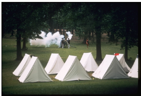
Figure 3. Soldiers fire a cannon at a battle re-enactment at Moore’s Creek National Battlefield.